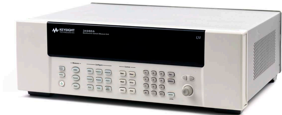
Figure 1. 34980A Multifunction Switch/Measure System

Four wire resistance measurements provide the highest accuracy by eliminating all internal path resistance and DUT lead resistance from the result. Typically, this requires two channels for each measurement. We offer an alternative technique, detailed in this application note, which eliminates the internal path resistance from PC board traces and additional relays in the measurement path.